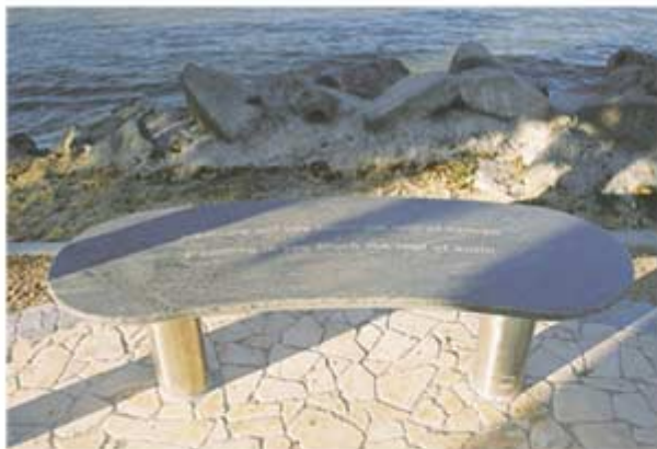
granite seat with text engraved by sand-blasting

breathing out you touch the root of heaven breathing in you touch the root of earth