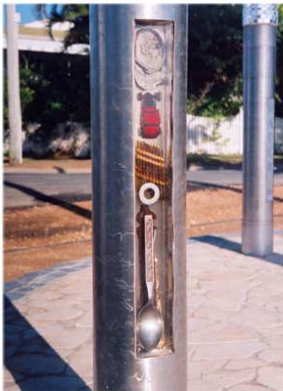
metal objects cast in resin into Metal Pole