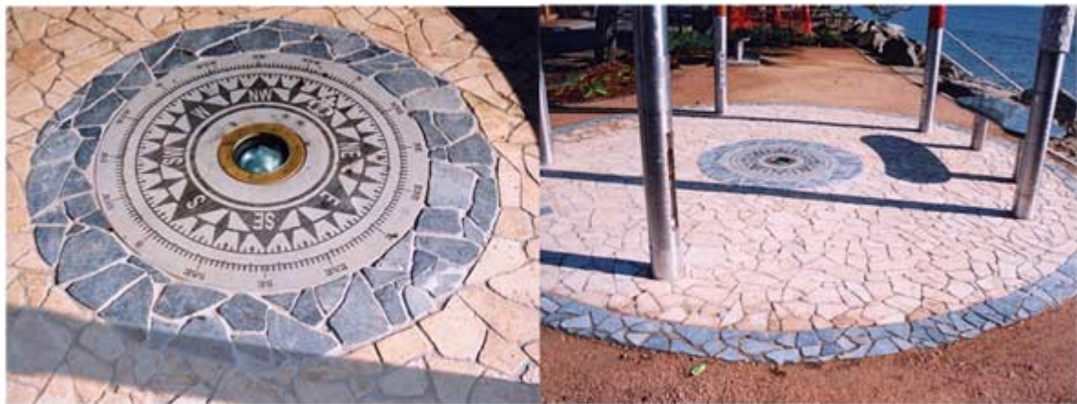
Compass and paved area using marble from Chillagoe and slate from Mount Carbine. Compass is sand blasted onto a granite circle. Human-touch light illuminates poles at night.