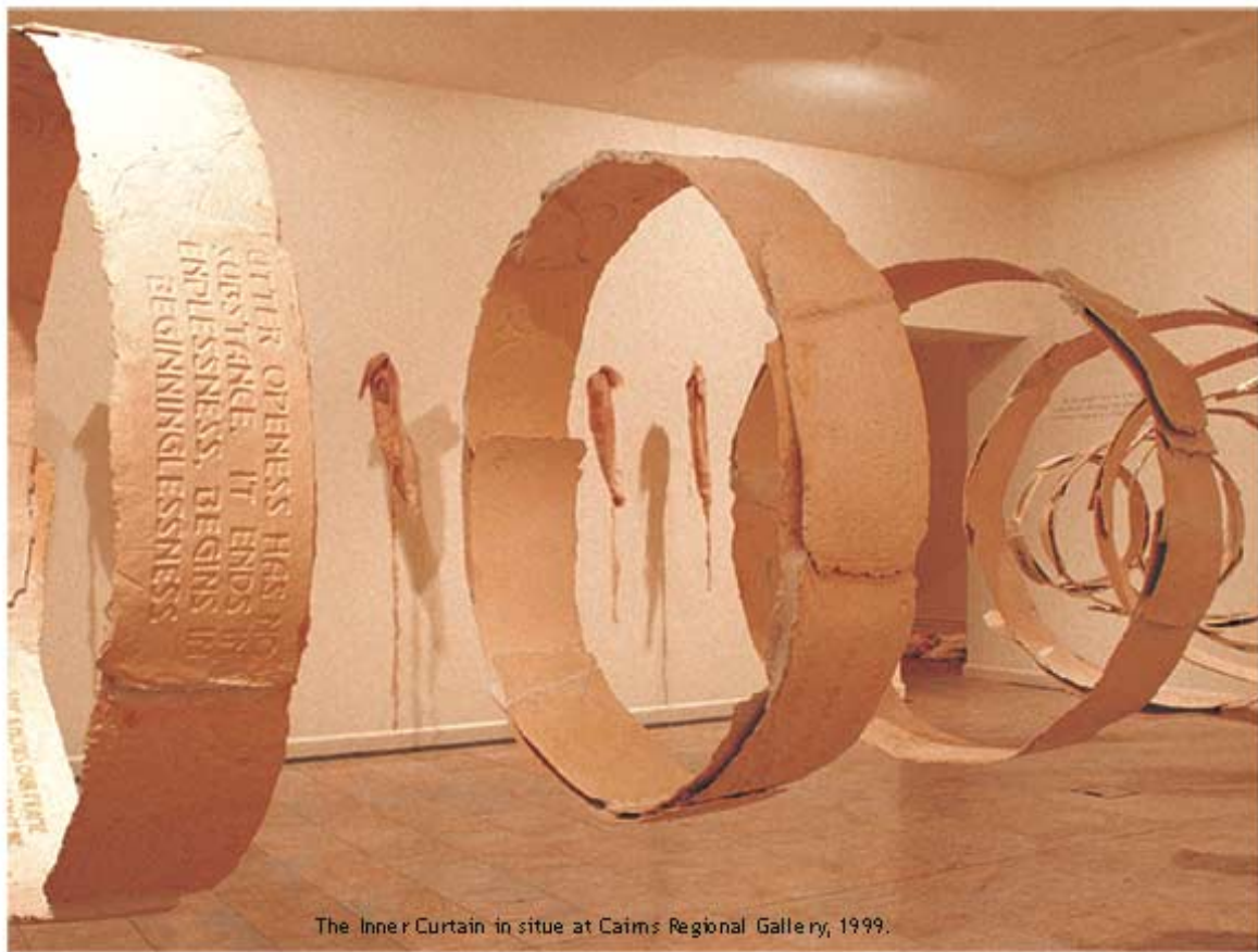
The Inner Curtain in situ at Cairns Regional Gallery, 1999.