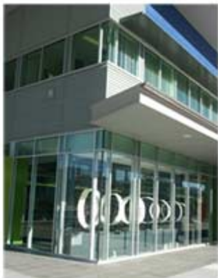
A more distant view