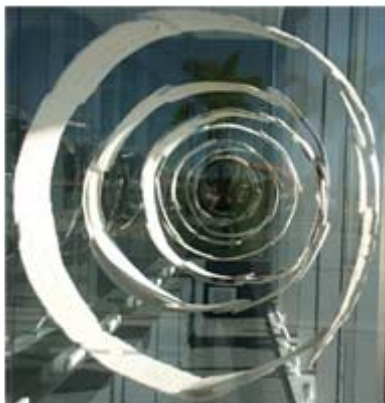
Looking through the glass cabinet from outside