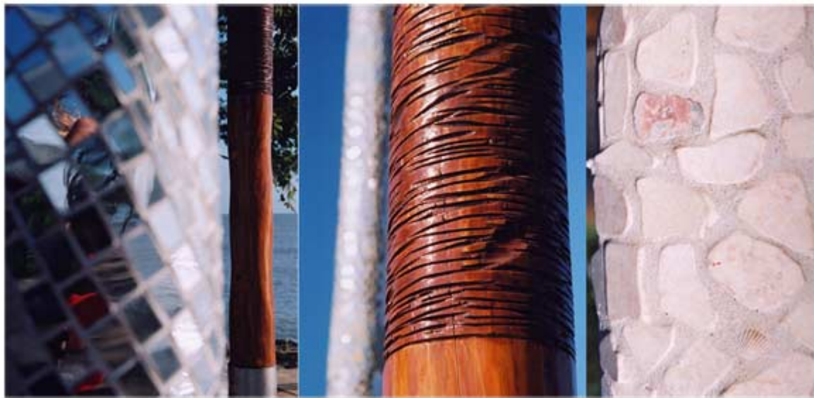
close up photographs of water, wood and earth poles