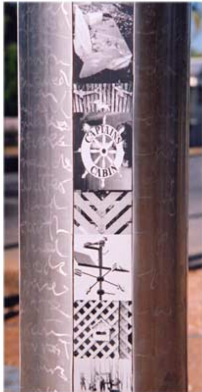
photos of wood elements at Machans Beach fixed by photo-infused aluminum process