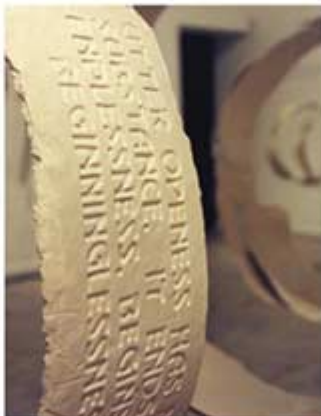
Text etched into fired clay