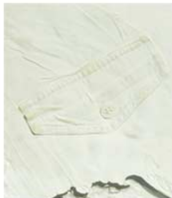
Clothing stamped into the clay

In 2003, The inner Curtain renamed The Inner Circle was placed in the new Pier Terminal Building designed by Cox Rayner Architects and constructed by Theiss Pty Ltd. A stipulation for the purchase of the work was the construction of a glass cabinet to house the work.