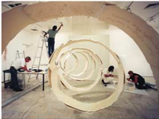
The Inner Curtain being installed at Cairns Regional Gallery

The Inner Curtain travelled to four galleries before being purchased by The Cairns Port Authority for the new Pier Terminal Building. The construction was part of City Port North Redevelopment. A glass cabinet was made to house the work at the entrance to the building.